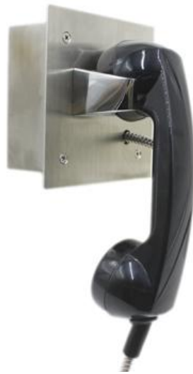
VoIP KNZD-55 Hotline telephone